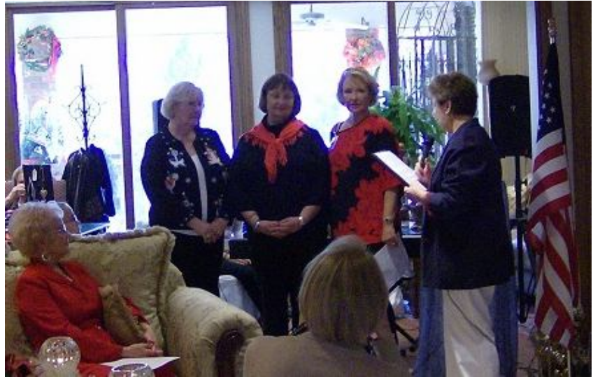
Swearing-in of officers