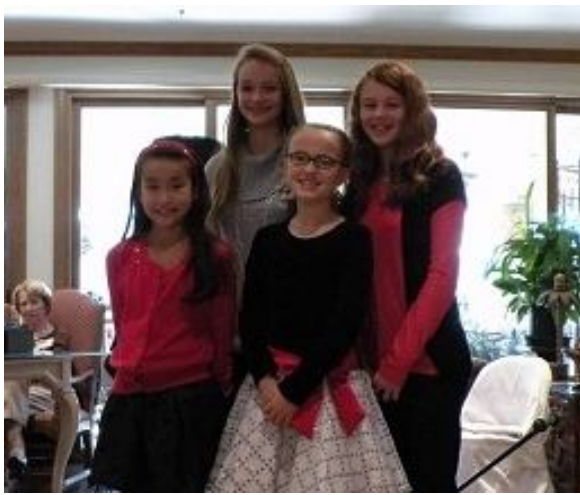
SHINE Performing Arts